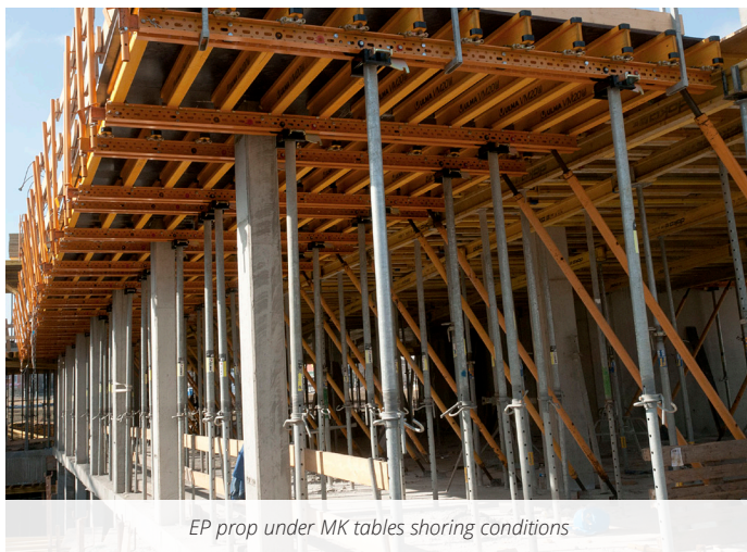
EP prop under MK tables shoring conditions