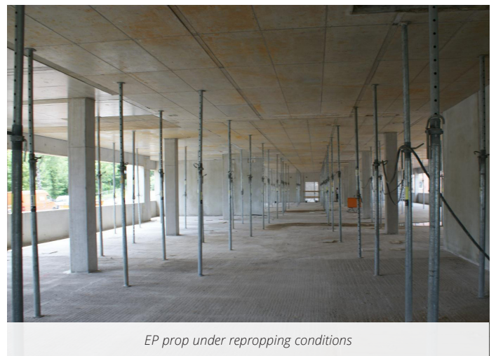
EP prop under repropping conditions